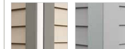
3-Piece Corner System

For a decorative 3-piece corner system, combine the corner connector with any of the window styles.